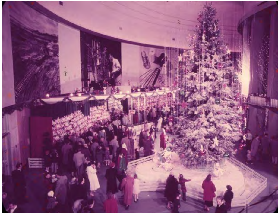
The Christmas tree and doll display at the 1955 Christmas Fantasy...