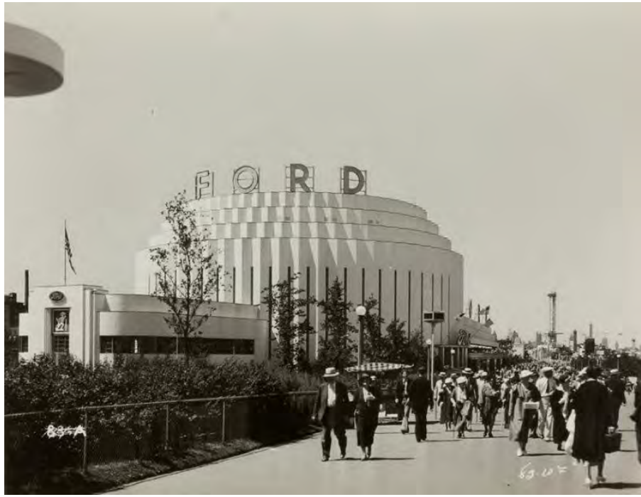
Visitors to Rotunda during the 1934 World Fair in Chicago...