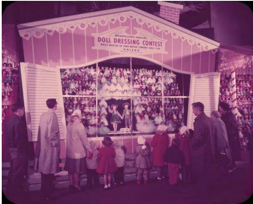
Visitors view dolls from the Ford Motor Company Girls Club Doll Dressing contest in 1958...