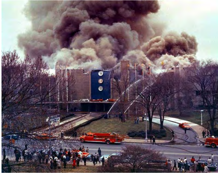
Ford Rotunda is destroyed by fire – November 9, 1962.

8 th Annual Model A Ford Parts Swap Meet At Cofer's 3702 Lawrenceville HWY Tucker, GA 30084 One Day – Saturday, August 13 th 2016 8 A.M. to 3 P.M.