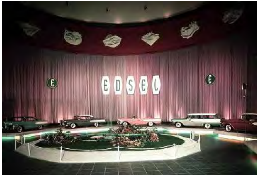
The 1958 Edsel introduction at the Rotunda...