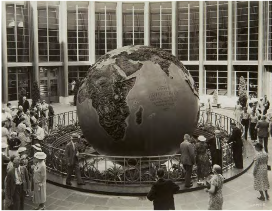
The Ford World exhibit...