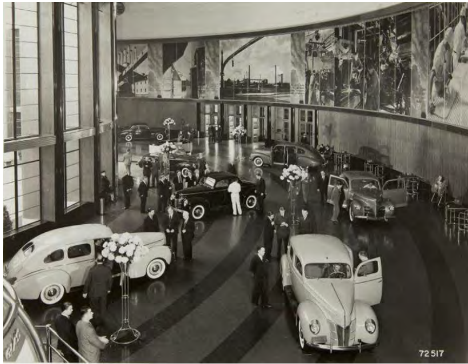
Ford Models for 1940 displayed in Ford Rotunda in 1939...