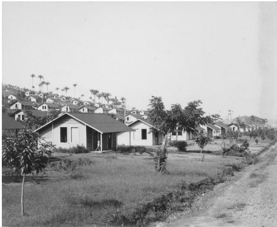
Town built by Henry Ford in Brazil