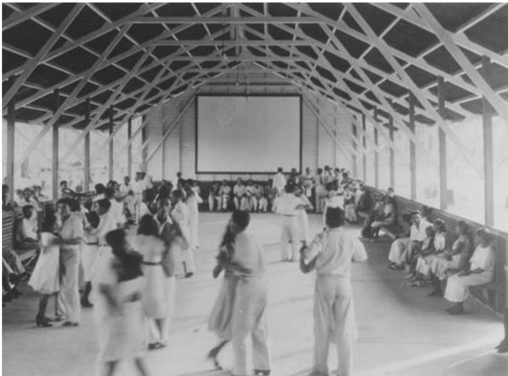
Dance Hall in Fordlandia