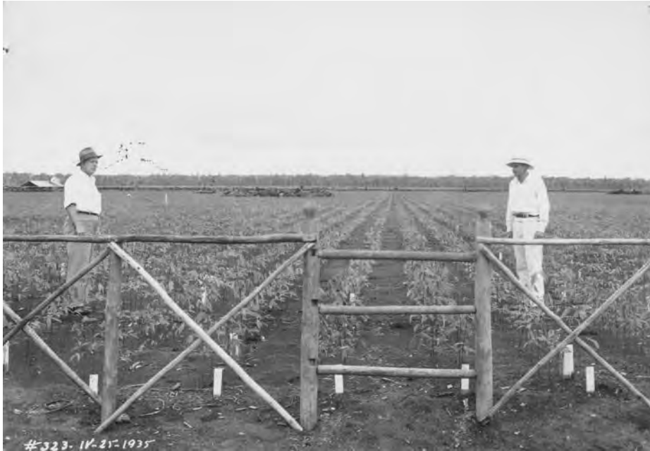
A rubber field at Belterra, better suited for rubber planting