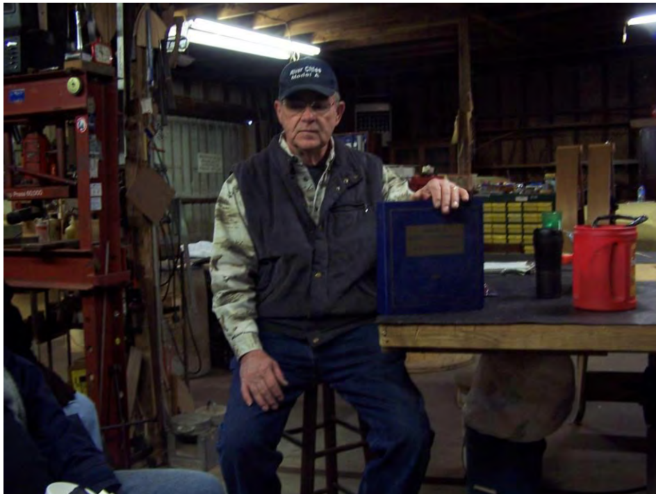
Working on your Model A? The best resource available for any Model A owner: The Judging Standards...