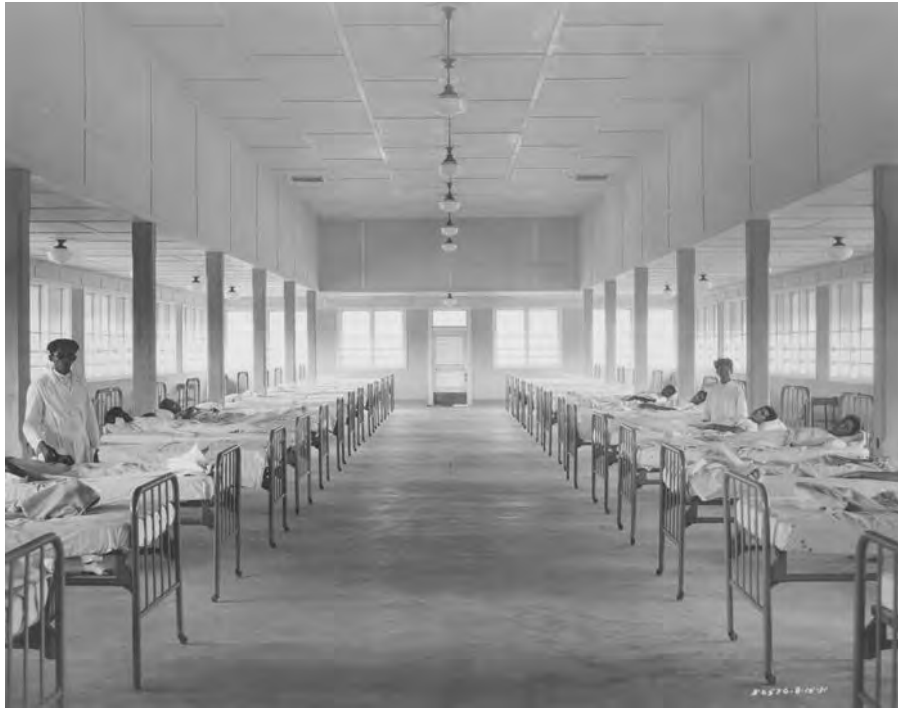
Hospital was well staffed and equipped