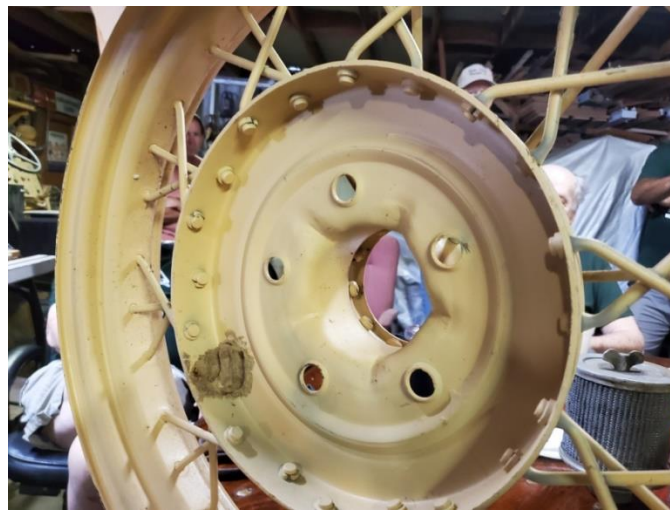
“Bobby showing a different type of a wheel used in the Model A, a Kelsey Hayes Wheel “...

Some of the many things you can learn during MATTS!