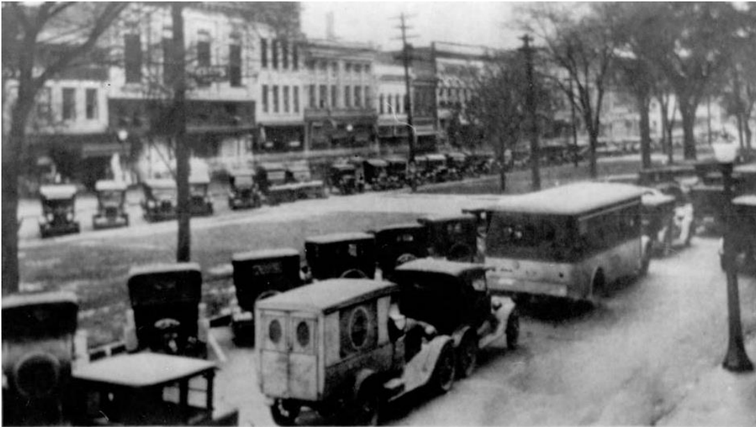
Boradway (Broad street) Back in the day

The Model A was the first Ford to use the standard set of driver controls with conventional clutch and brake pedals, throttle, and gear shift. Previous Fords used controls that had become uncommon to drivers of other makes and a rear-view mirror was optional! The Model A was also the first car to have safety glass in the windshield.