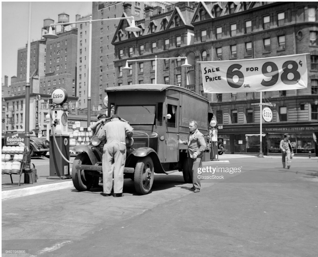
1930s TRUCK FILLING UP AT ESSO GAS STATION ADVERTISING 6 GALLONS FOR 98 CENTS