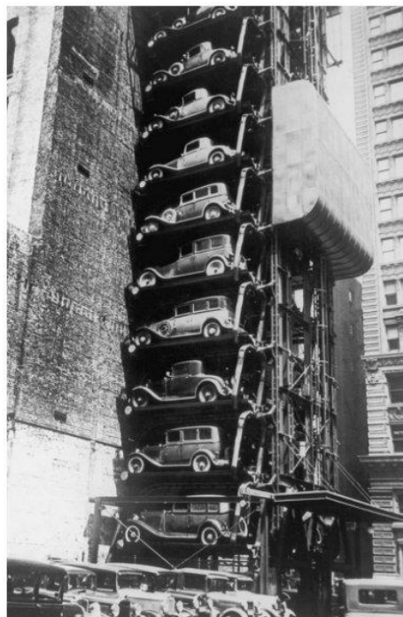
Elevator parking in the 1930's