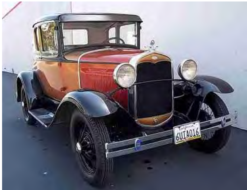
From Rags to Riches