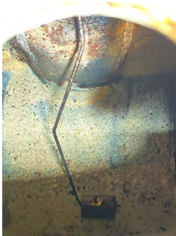
“This is how the gas tank looked after one day treatment with Rust 911! The best part, it is not harmful to the environment” This is one of many things you can learn at MATTS ” Hope to see you at the next MATTS!