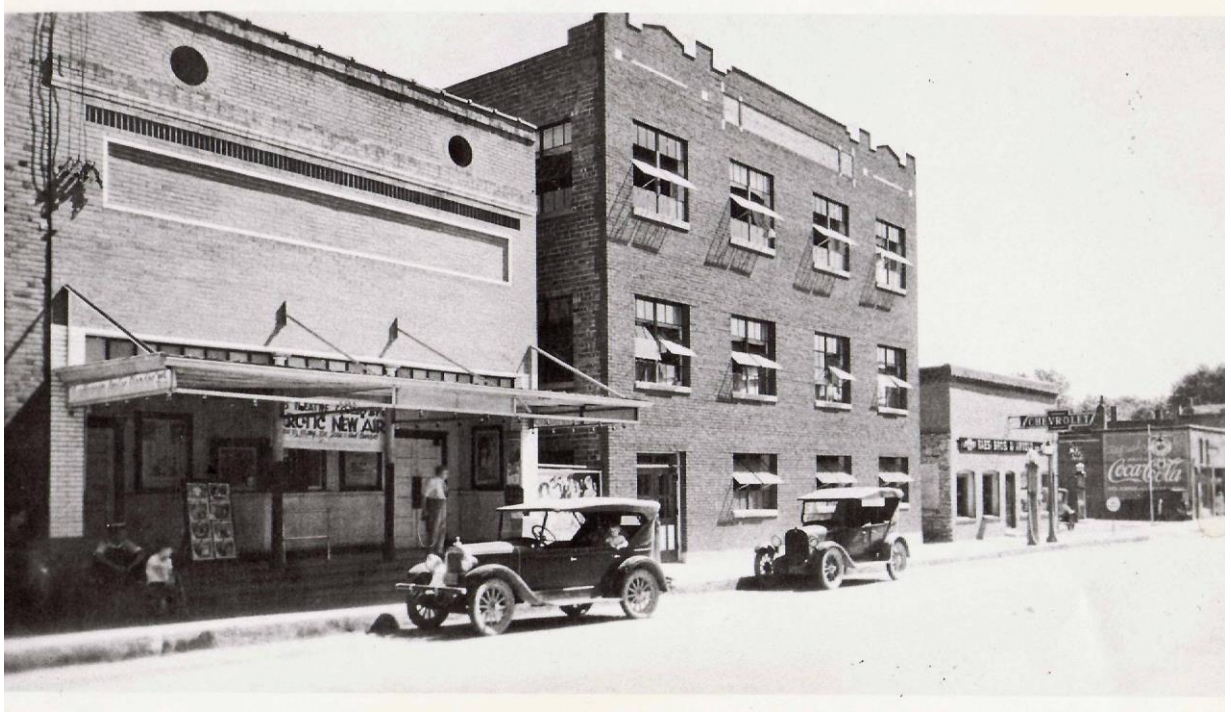
Phenix City, Alabama