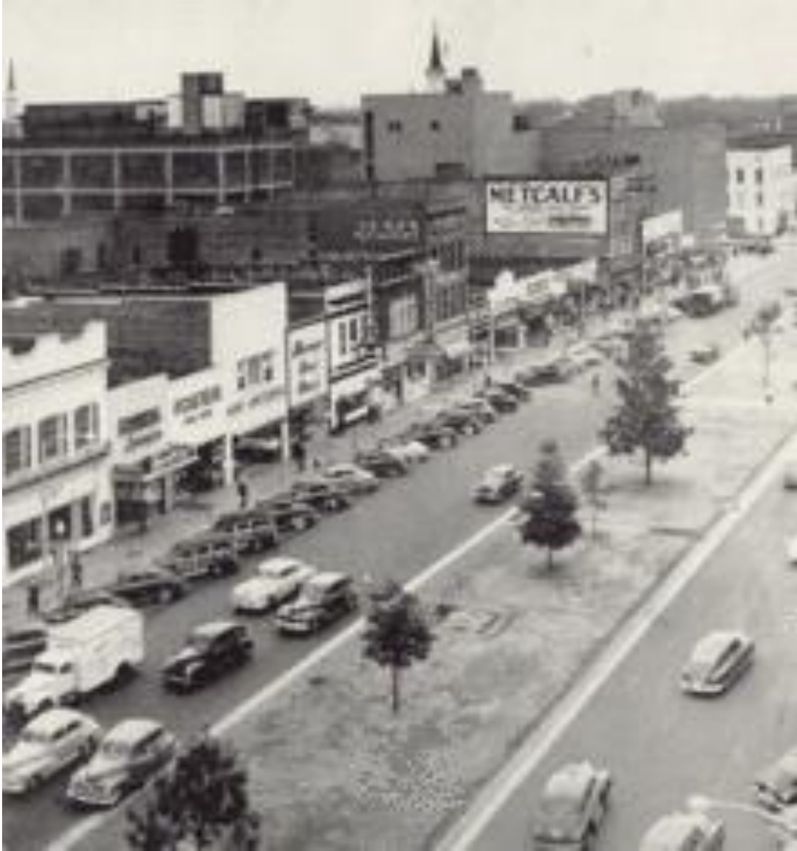
Columbus GA Back in the day