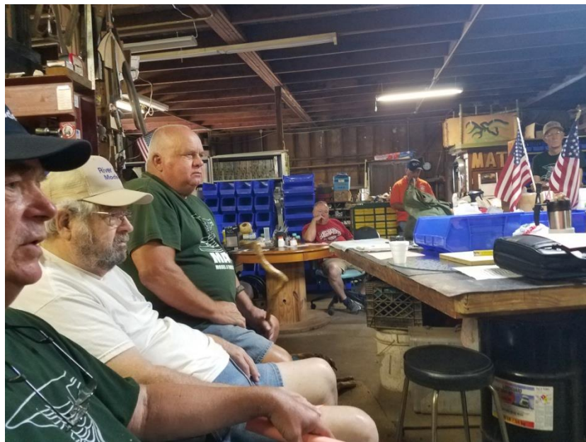
“Members listening to the discussion” ...