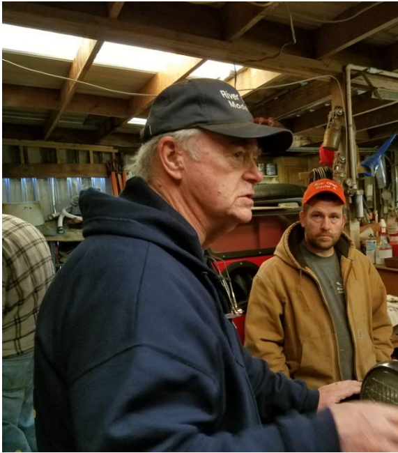
"Talking about the shims used in the rear model A axle" ...