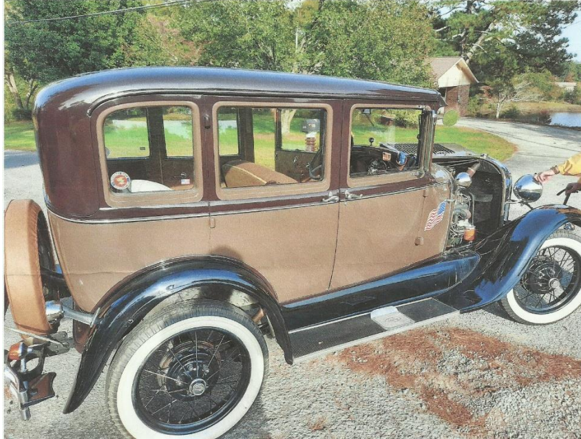
1929 Town Sedan

Not a show car but a Model A set for touring